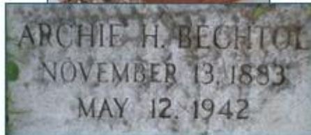
Archie Harrold Bechtol 13/11 1883 – 12/5 1942