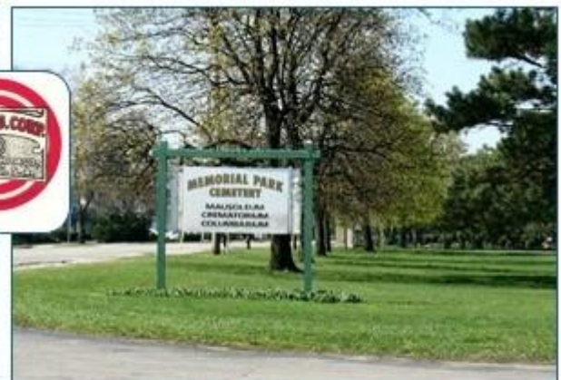
Memorial Park Cemetery, Skokie Cook County, Illinois