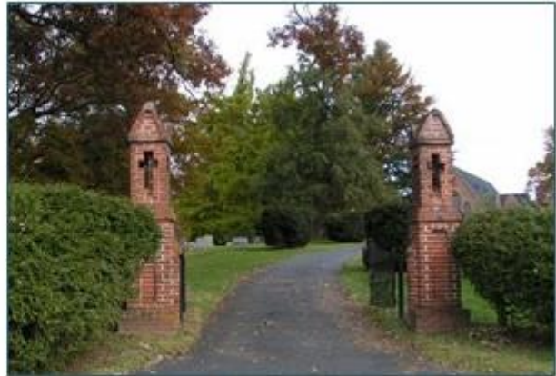
Calvary Episcopal Church Cemetery, Fletcher Henderson County, North Carolina