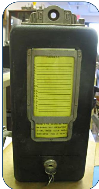
A.B.T. Wall Box, 1939

(☼ April 21, 1872) († December 24, 1941)