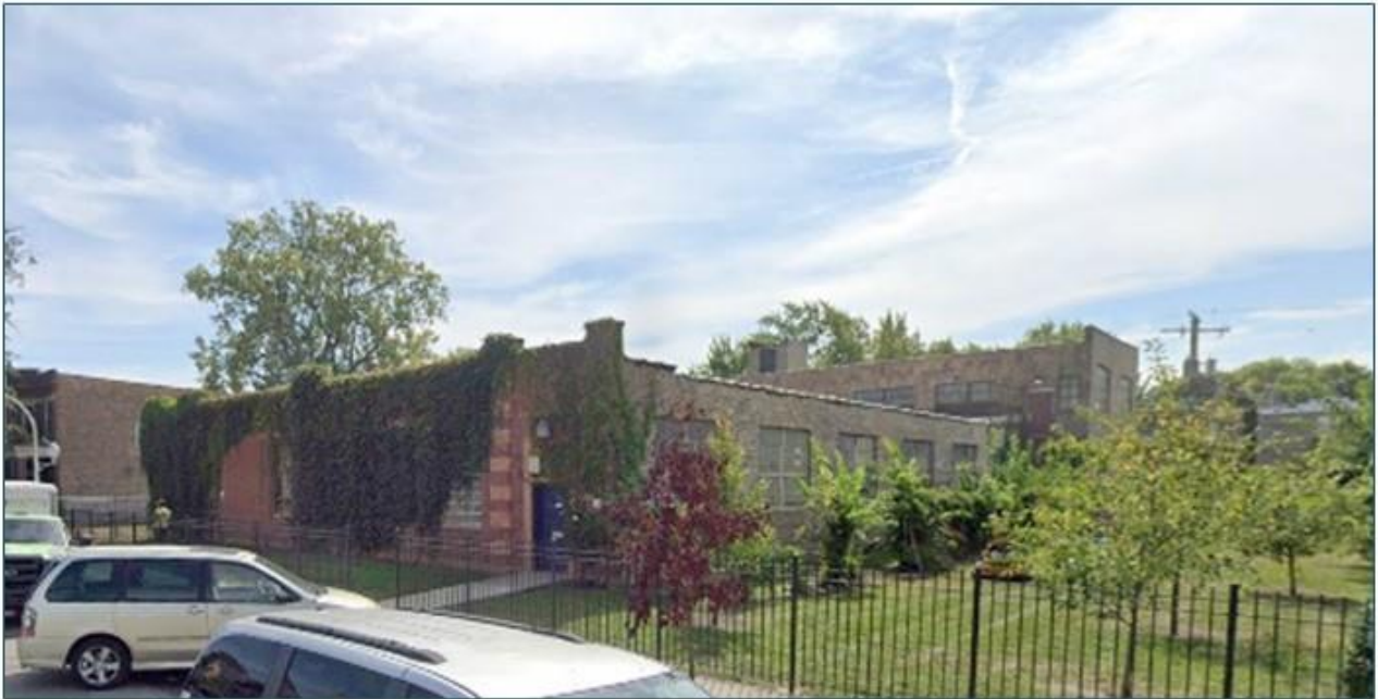
3311-3319 W Carroll Avenue (Sept. 2024)

A. B. T. MANUFACTURING COMPANY 3311-19 CARROLL AVENUE CHICAGO, ILLINOIS