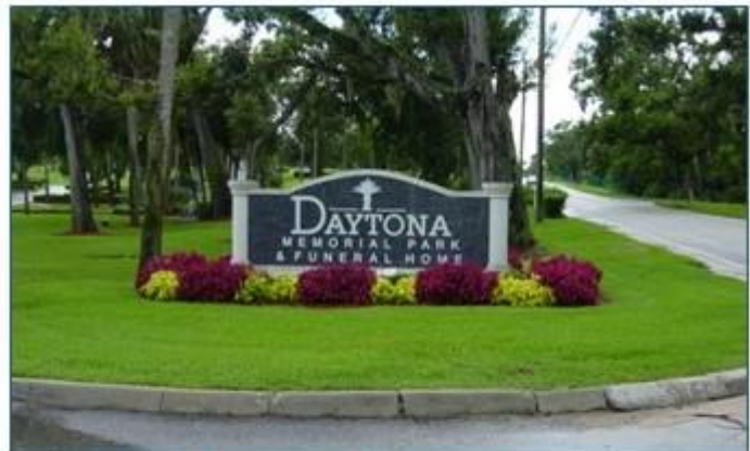
Daytona Memorial Park, Daytona Beach Volusia County, Florida Section A