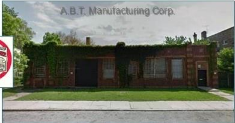
(passed away in Chicago, Illinois) (burial details unknown)