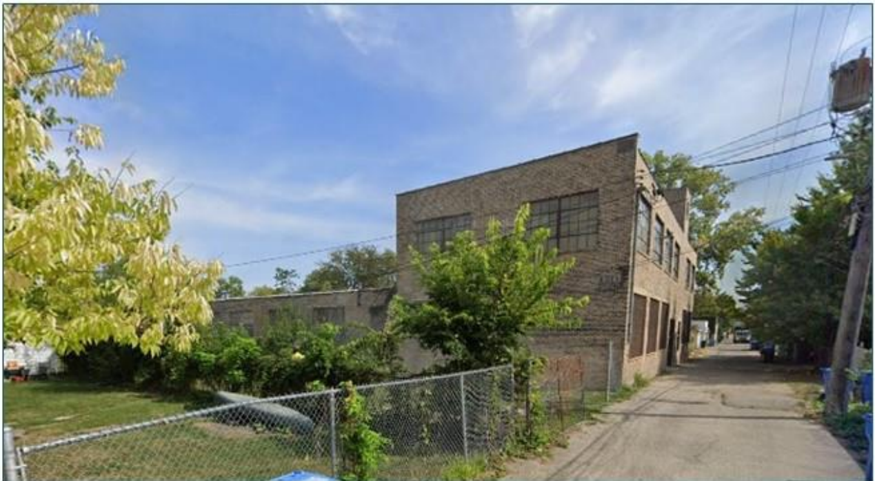
A.B.T. building rear, East Garfield Park (Sept. 2024)

A. B. T. MANUFACTURING COMPANY 3311-19 CARROLL AVENUE CHICAGO, ILLINOIS