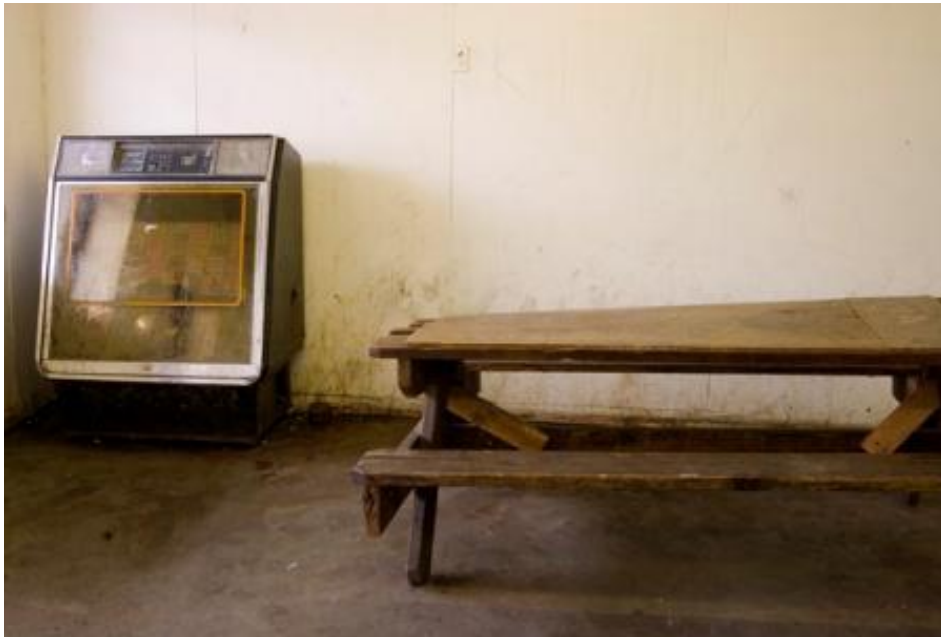
AMI/Rowe "R-85 Starlight" (1981) at Bruno's juke-joint in Alligator a little south of Clarksdale.

Take a look at these photos showing real jukeboxes on location in real-deal juke-joints in the Delta: