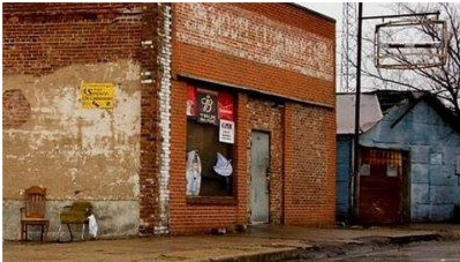
C.W.'s Blues Club, also known as Margaret's Blue Diamond, at 381 West Tallahatchie Street in Clarksdale.

Also take a look at these photos showing some of the classic real-deal juke-joints in Mississippi: