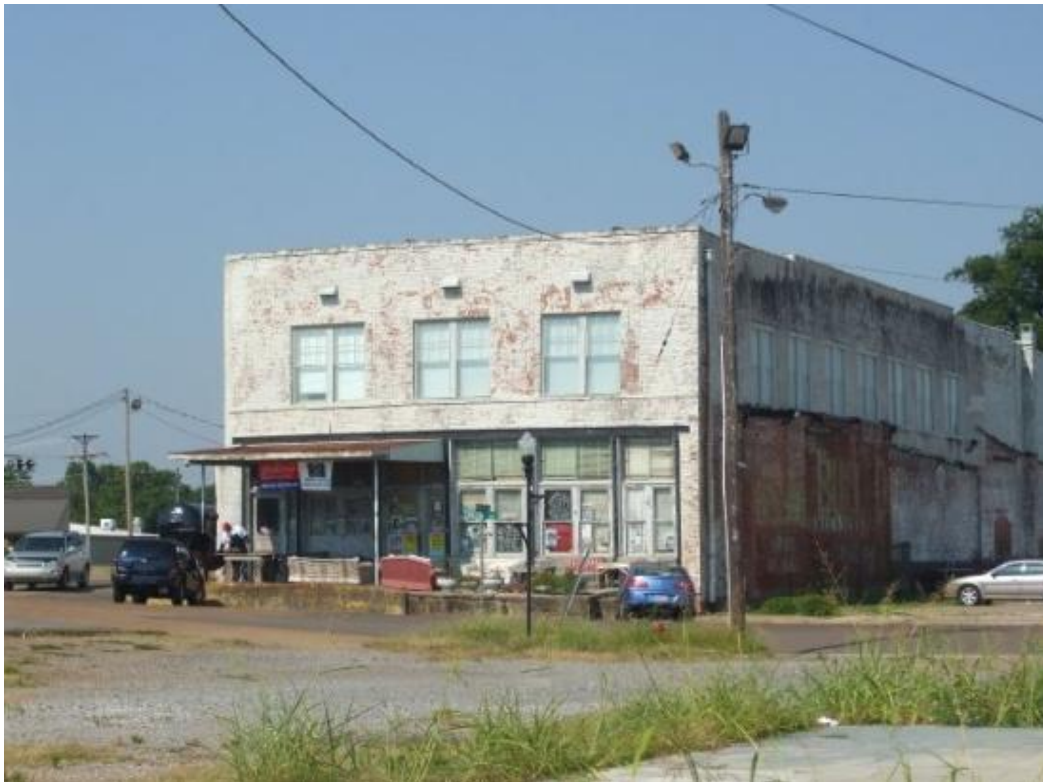
Ground Zero Blues Club, Blues Alley, Clarksdale (2009).