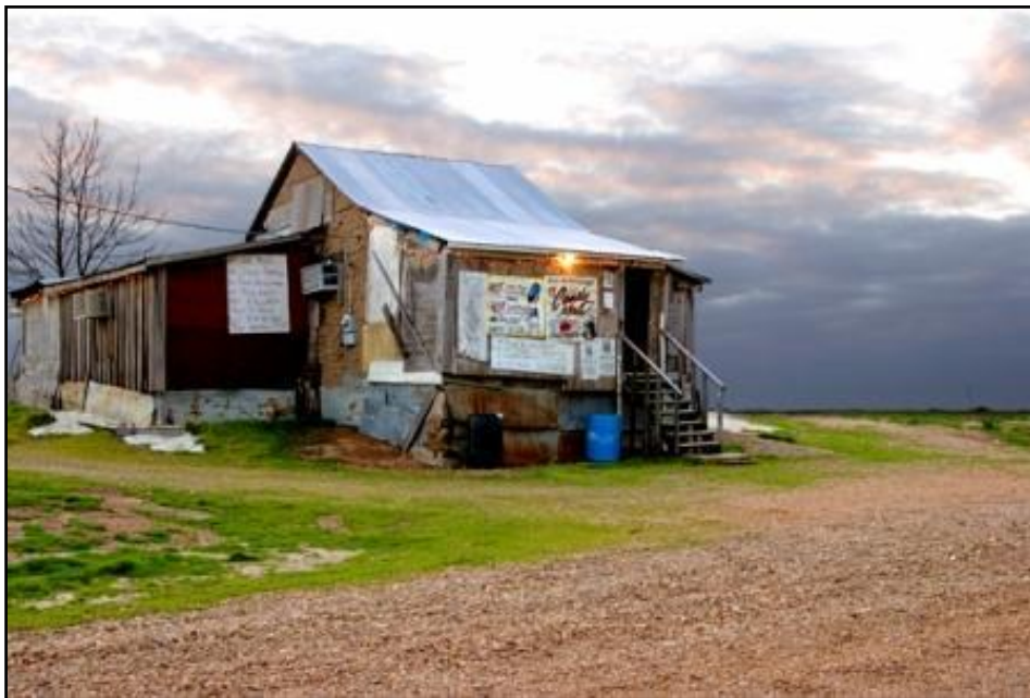
Po' Monkey's Lounge, a real classic countryside juke-joint, a little outside Merigold north of Cleveland (photo by Daryl Thetford).