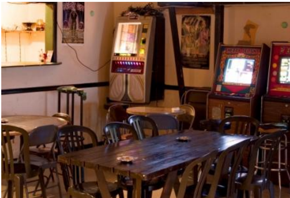
AMI/Rowe "LaserStar Eagle" (1995) in the Club 2000 at 349 Issaquena Avenue in Clarksdale (photo by Daryl Thetford).