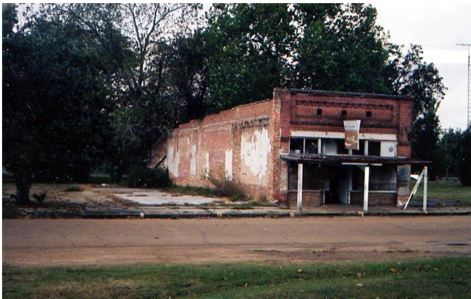
Old abandoned jook-joint with no name near Moorhead a little east of Indianola.