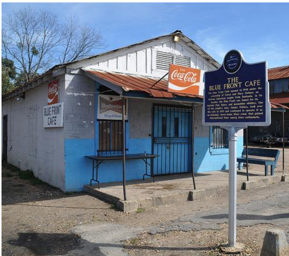
The historic Blue Front Café at 107 East Railroad Avenue in Bentonia a little north of Jackson (photo by Kees Wielemaker).